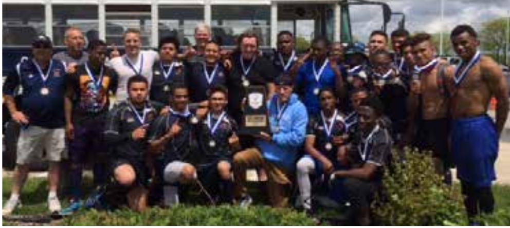
Chicago Hope Academy 2015 Rugby State Champions

Athletic fields and programs for the children of Chicago's North Lawndale and East Garfield Park communities